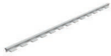
Goma para rejilla 9710 · Grate rubber 9710

Goma para rejilla 9710 incluida Grate rubber 9710 included