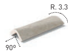
Cantonera transición exterior External transition corner