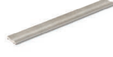
Media caña interior Inner trim