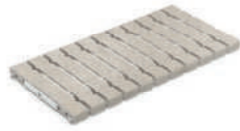
Rejilla de drenaje RJ25 FLEX · Drain grate RJ25 FLEX

Goma para rejilla 9710 incluida Grate rubber 9710 included