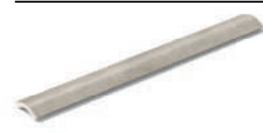
Media caña exterior Outer trim