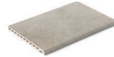
Borde Creta · Creta edge