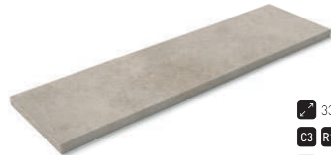
Peldaño recto tapa · Recto step corner