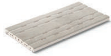
Rejilla de drenaje RJ25 · Drain grate RJ25