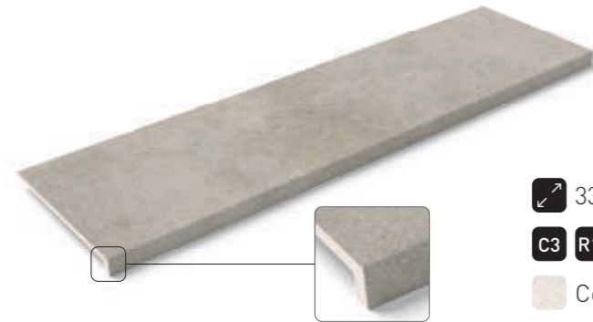
Peldaño recto · Recto step